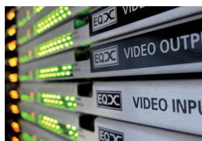
Evertz EQX video router system

Wilhelm Vinke, System Architect, NDR: “With the new build of our auxiliary studio in Hamburg-Lokstedt we are now able to produce TV programmes in HDTV more independently from our main studios. The integration of state-of-the-art technology enables our teams to flexibly react on changing production situations. By implementing standardised production workflows the new studio seamlessly fits into our growing HDTV infrastructure.”