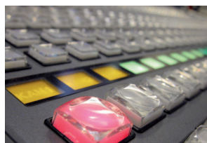
Console vision mixer