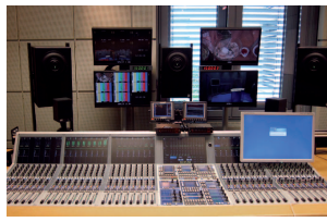
5.1 audio editing