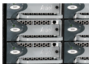
Expansion units, Avid Unity ISIS

In an area of some 2,500 m 2 the technology was adjusted for the special production requirements of the FIFA World Cup and integrated in the relative operation fields such as studio, direction, central control room, production and post-production.