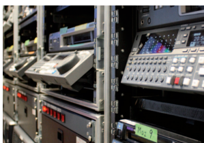
HD capable VTRs