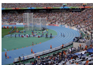
Stadium in Barcelona

Project Description: Based on our long-term experience in outfitting broadcasters with technical equipment for major events, German public broadcasters assigned us as technical partner for the 2010 European Athletics Championships. A wide range of tailor-made components were integrated into ZDF's mobile production unit in Barcelona, where the equipment went in operation in the fields of signal processing, tapeless production, editing, direction and monitoring.